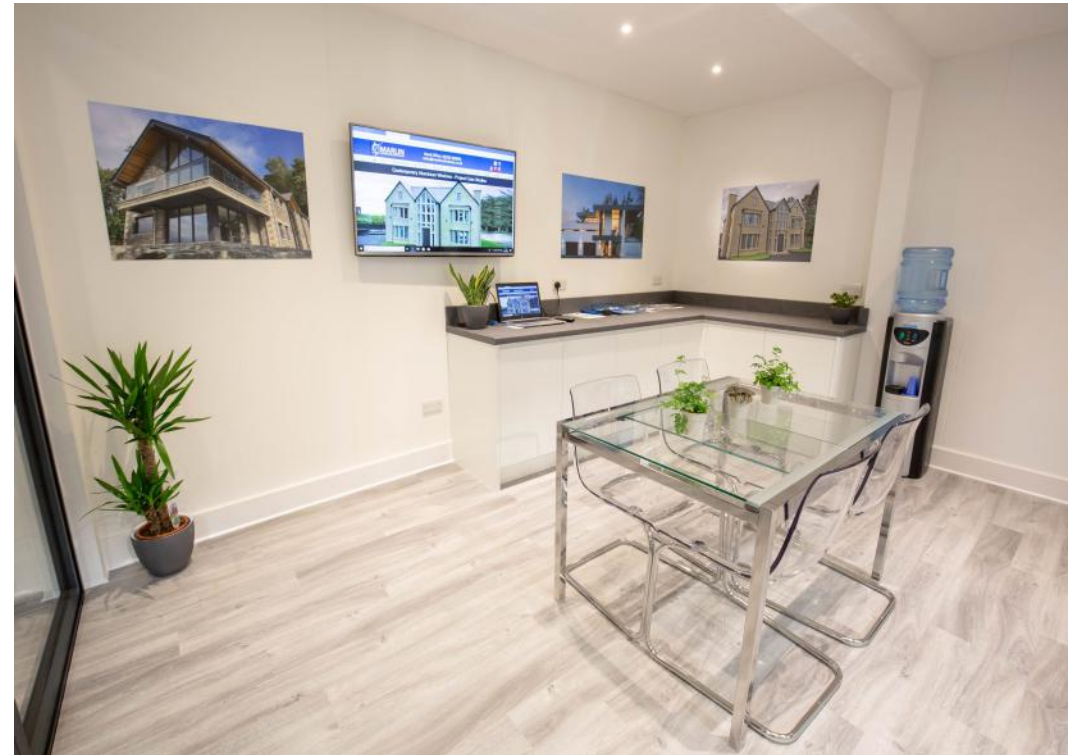
Dedicated meeting space to discuss all of your aluminium glazing requirements

For showroom opening hours, visit www.marlinwindows.co.uk