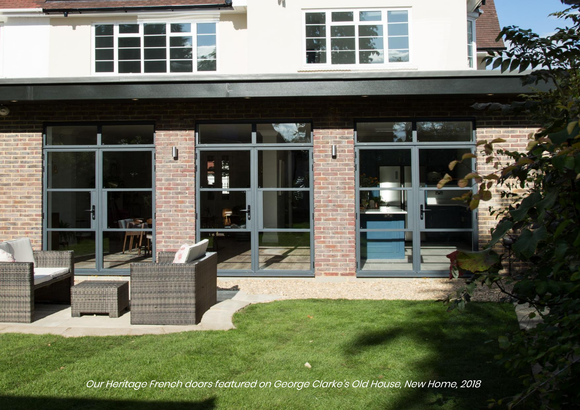
Our Heritage French doors featured on George Clarke's Old House, New Home, 2018