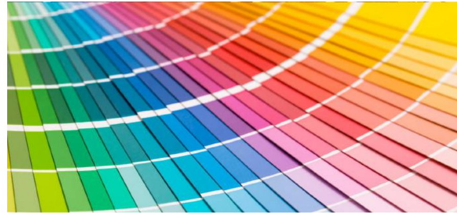
EXTENSIVE RANGE OF RAL COLOURS TO CHOOSE FROM

Alternatively, we can post free colour samples that will be powder coated onto aluminium plates.