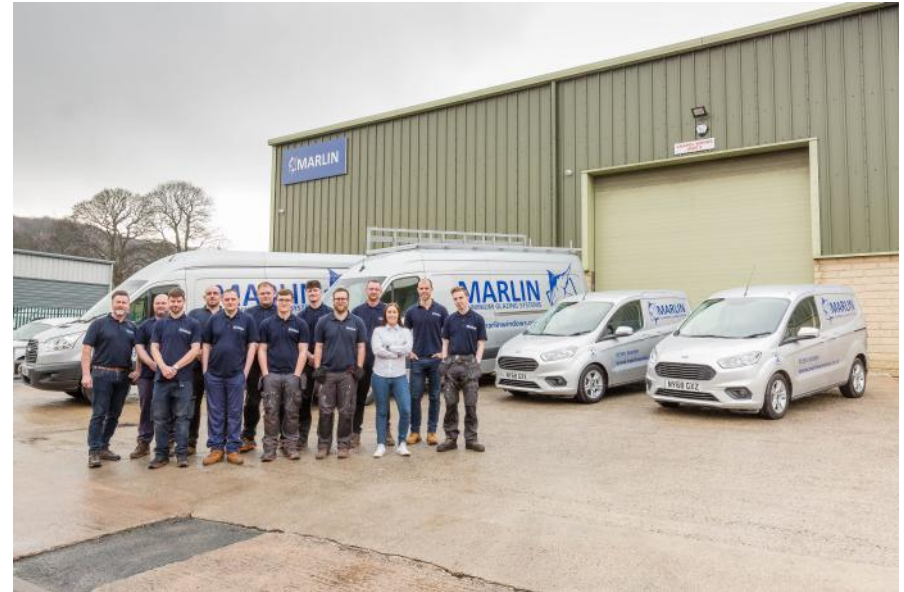
Marlin team photo, 2020

Our belief that total client satisfaction is built on the successful hassle free completion of a project has earned us an enviable reputation as a committed and trustworthy glazing solution provider who places the client first, every time.