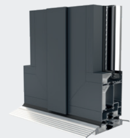
DOUBLE DOOR MEETING STYLE & LOW THRESHOLD