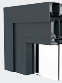
DOOR SASH CORNER