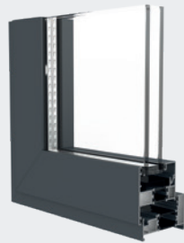
WINDOW SASH CORNER