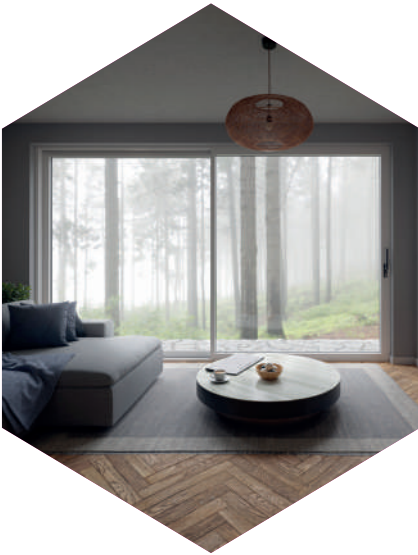
Prestige LIFT & SLIDE PATIO DOOR

Up to 31% slimmer than market competitors, our multi-track aluminium lift & slide Patio combines flawless minimalism with exceptional thermal performance.