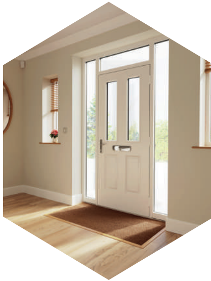
Prestige COMPOSITE DOOR FRAME

Available in stepped and contemporary styles, the Prestige Lift & Slide Patio perfectly matches the rest of the Sheerline range.